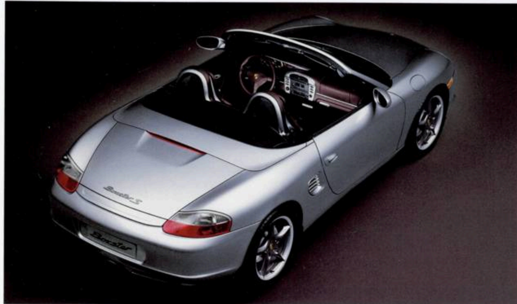
European model represented.