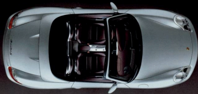
European model represented.