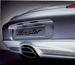
European model represented.

A UV-resistant Cocoa Brown canvas top specially designed for the Boxster S Anniversary Edition offers an elegant contrast to the high-tech exterior and a tasteful