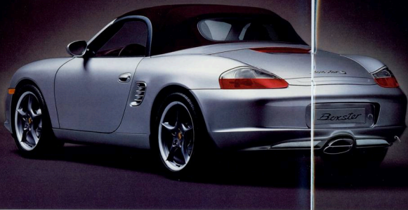
European model represented.